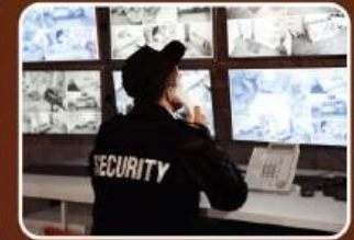
Security For Residential Flats