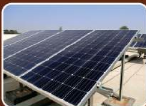
Solar Facility for Common Areas & for Each Individual Flat