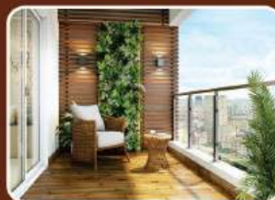
Extra Large Size Balcony Attached to Living