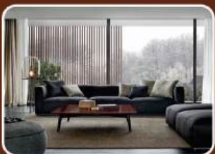
360° Open View for Each Flat with Ample Ventilation