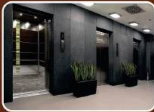
3 Automatic Lifts with UPS Power Backup