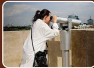
Telescope View Point on Terrace