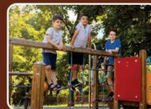
Kids Play Area & Garden