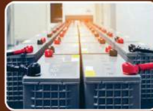
Power Backup For Common Areas